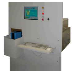
Through The Wall