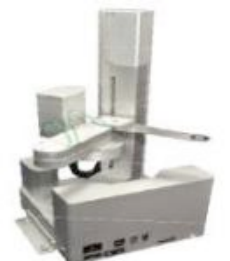
Integrated Robust Solid Robot